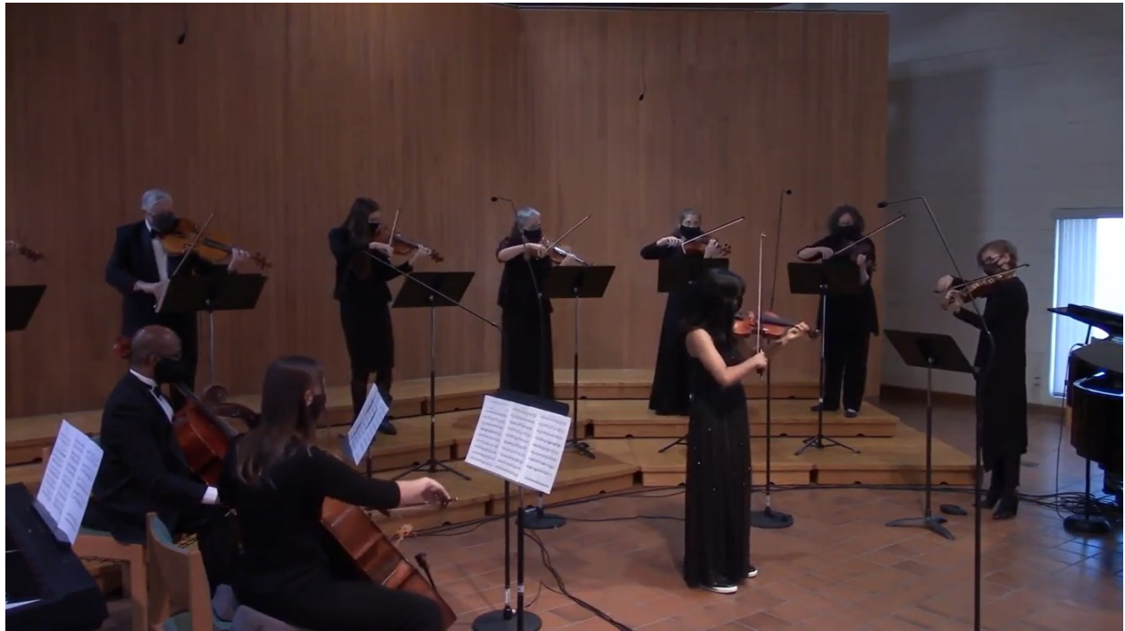
Screenshots from November 2020 virtual concert

December 19, 2020 ProMusica Arizona small ensembles presented a free live streamed concert titled A Christmas Kaleidoscope . (YouTube 457)